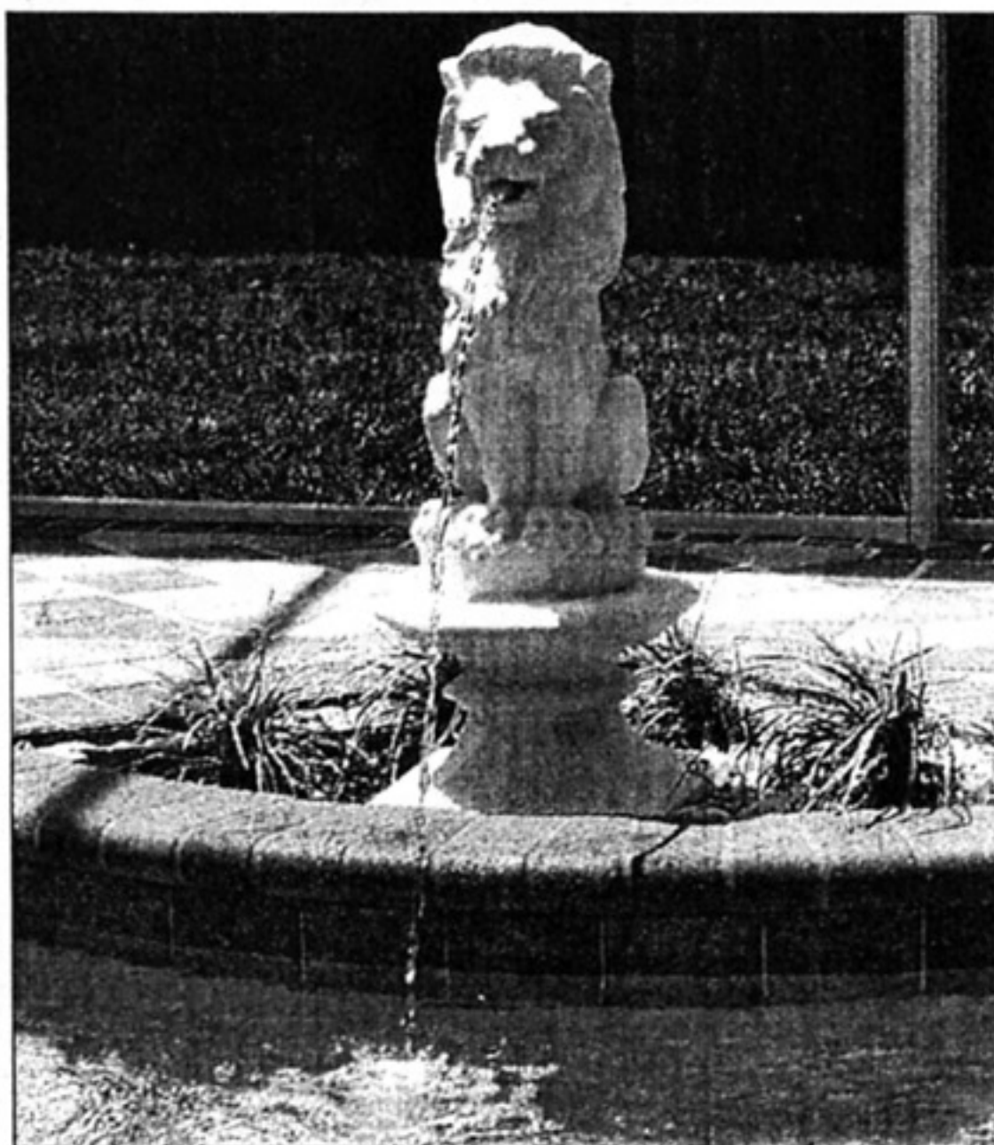
LARGE POOL at model is flanked by pair of water-spouting lions.